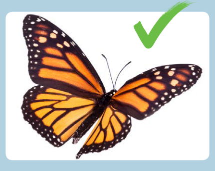
300ppi (high resolution)