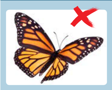
72ppi (low resolution)

Common types of vector graphics include Adobe Illustrator (ai, eps), Adobe Acrobat (pdf) and Art Pro (ap).